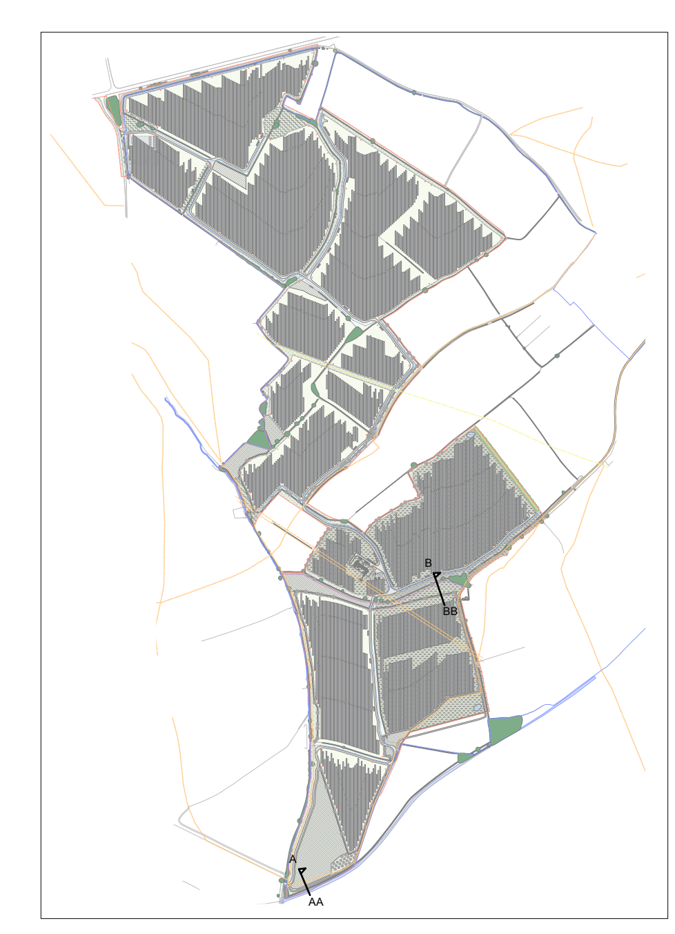
Site Location Plan (Scale NTS)